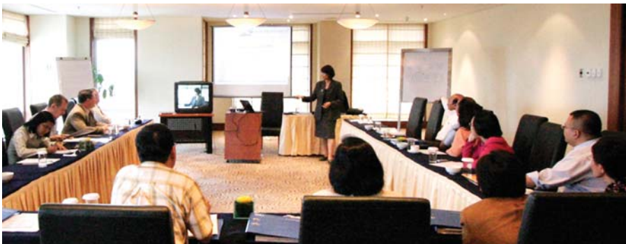
Video Training Session